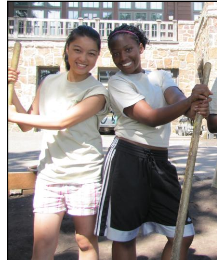
Youth build a staircase at Theo Wirth Golf Course

These picnics were attended by youth job trainees, Tree Trust staff and community leaders who presented 26 youth with Governor's Awards for outstanding leadership and achievement. An additional 68 youth participants received awards for perfect attendance.