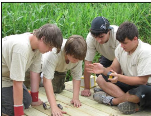
Youth practice measuring skills while building a boardwalk at Lake Elmo Park Reserve

Of the youth who responded to post-program surveys, 77% rated their experience as good or excellent and 81% said they would recommend Tree Trust to a friend. Parents echoed these feelings – 89% were satisfied with the program and 90% would want their child to work for Tree Trust again.